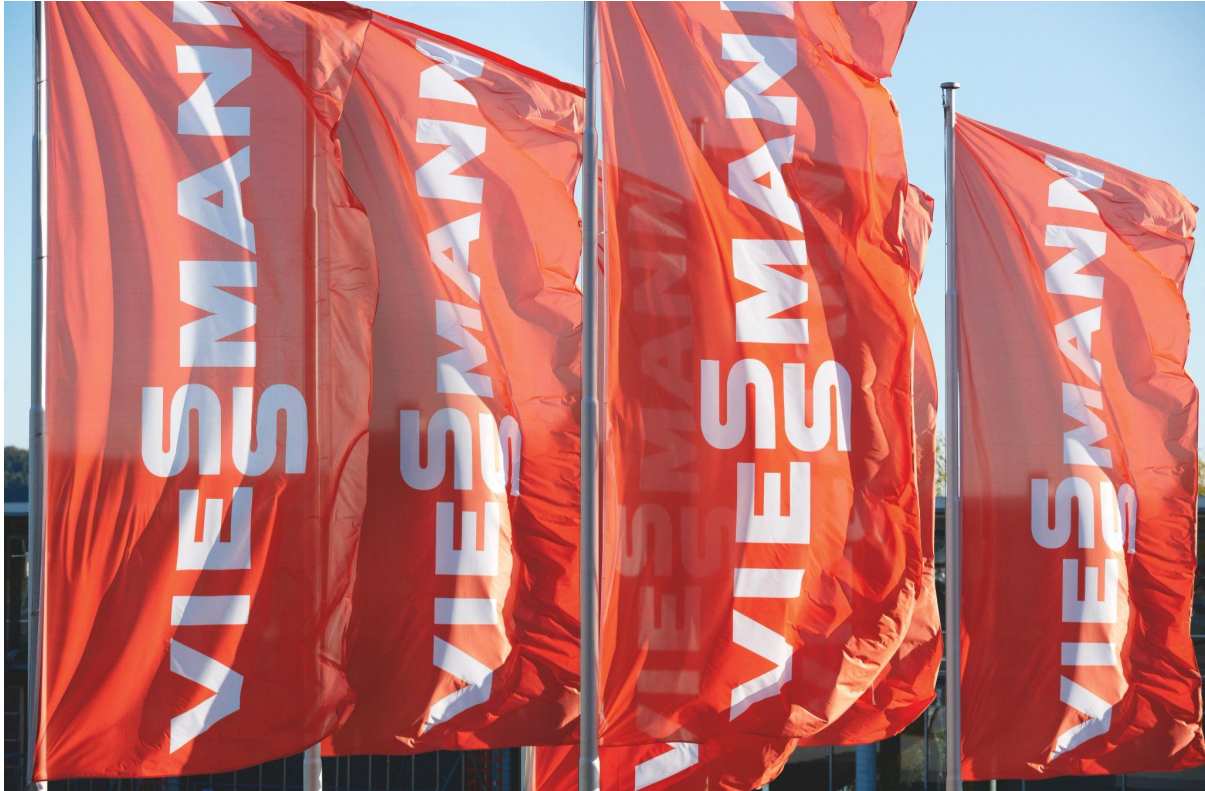
Caption: Viessmann flags in front of the headquarters in Allendorf (Eder).